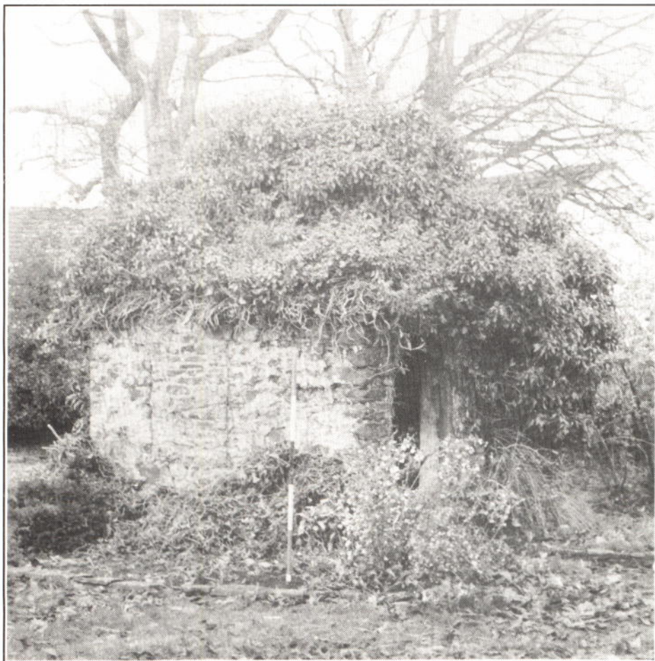
Overgrown but not over-built: the weighhouse at the Elms Colliery