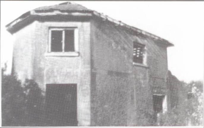
The Bad . . . . . Before materials were scavenged, 1987