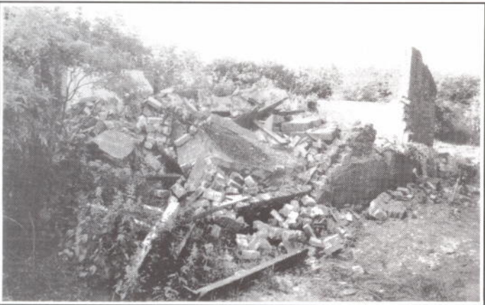
The Ugly . . . . . Demolition, 1991