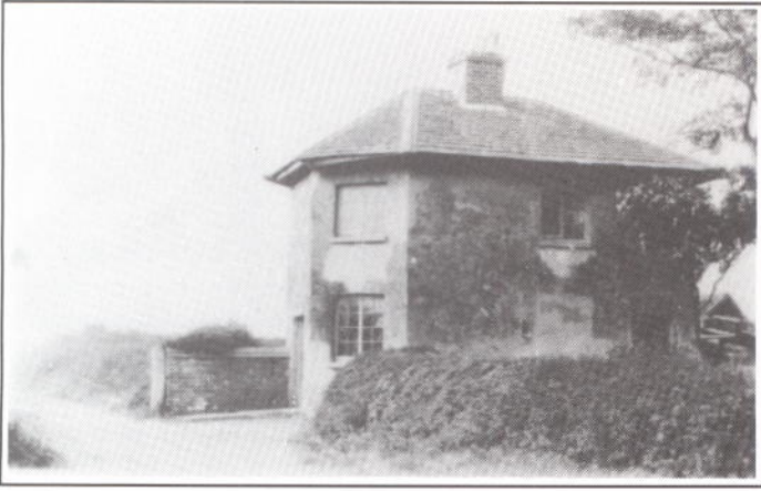
The Good . . . . . Bagworth Incline Keeper's Cottage, c1908