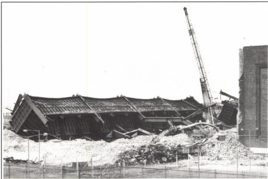
A Giant felled: Croydon B Power Station during demolition in February 1991 - see opposite