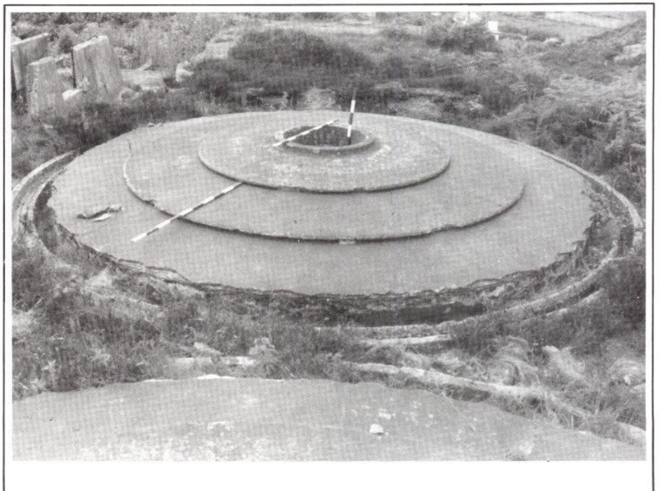
3. Stepped buddle, Brea Adit tin-streaming site, Cornwall, early 20th century.