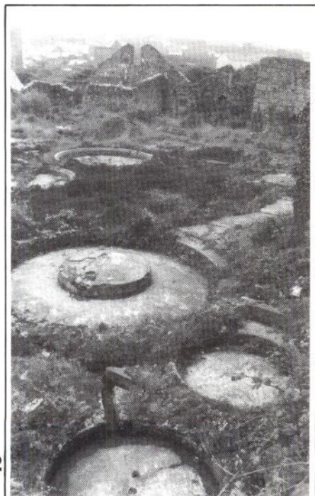
2. Concrete centre-head buddle, West Basset, Cornwall, 1875

tate. The two archaeologists actually employed by the Trust are concerned with field survey and documentary research along similar lines to the Nuffield Project. Our task is excavation, but with limited manpower and time, since industrial archaeology is not our profession, site evaluation utilising other evidence is essential. Maps in Derbyshire Record Office indicating the projected routes of tramways from the Ashby Canal to Ticknall suggest that 'new work' had begun in Margaret's Close about 1800. Documents showed that this had been worked by a separate company selling lime to, among others, the Melbourne Hall estate but that by 1802 they were in financial difficulties. A financial statement refers to 180 double yards of Iron Railway and four lime kilns, but subsequently the area is not referred to again in the documentary record. A careful survey of the area revealed the likely site of the kilns, a bank with some evidence of surface stone. Excavation has so far revealed one of the kilns which appears to have been rebuilt utilising some vitrified bricks but not subsequently fired, archaeological evidence which is supported by the documentary evidence indicating the liquidation of the company.