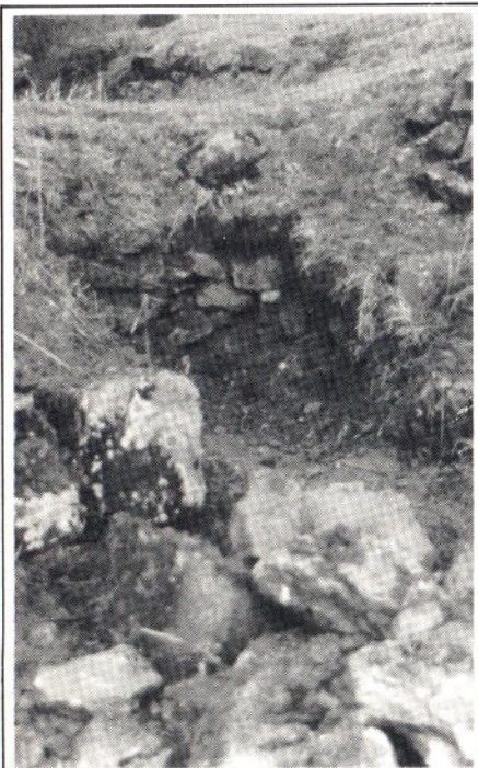
4. The site of Margaret's Close limekiln, before excavation.