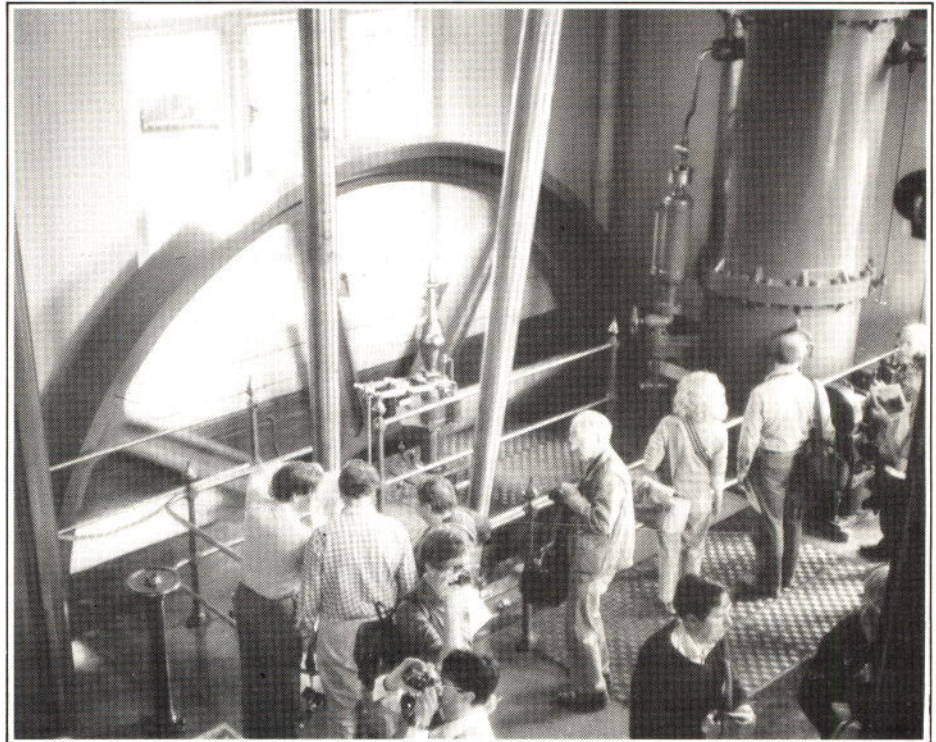
Preserved 1902 Glenfield and Kennedy Beam Engine at Bristol Waterworks Company's Blagdon Pumping Station.