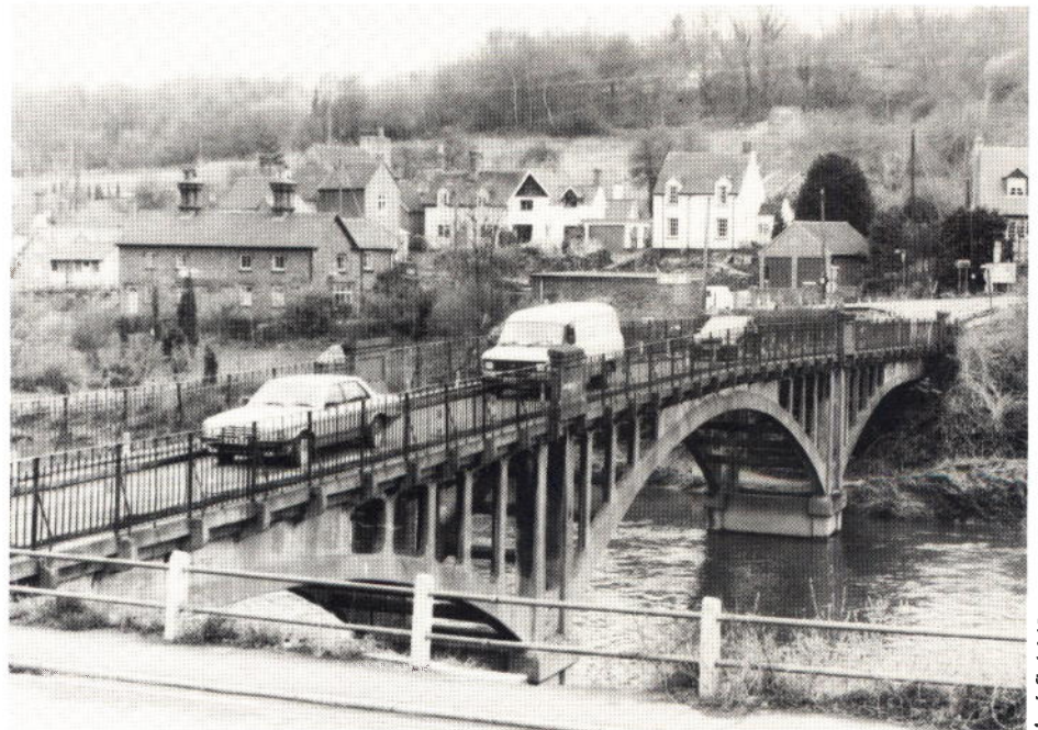
Jackfield 'free bridge' today

Half a century later the Building Research Station and the Cement and Concrete Association investigated the durability of early reinforced concrete, which made it inevitable that they examined many Mouchel-Hennebique structures. Just one example was a factory built in Hull in 1900 and said to have 'stood normal and at time rough, usage with negligible maintenance for over 50 years . . . and was in remarkably good condition'. 2 Associated with this building was a reinforced concrete girder bridge of about 40 ft span over