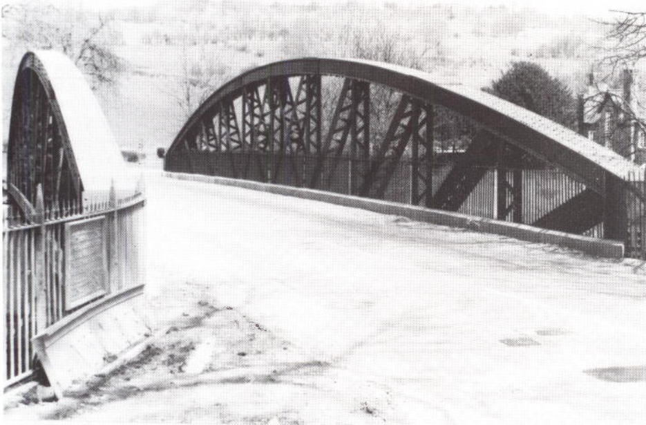
Buildwas iron-bridge, c1905