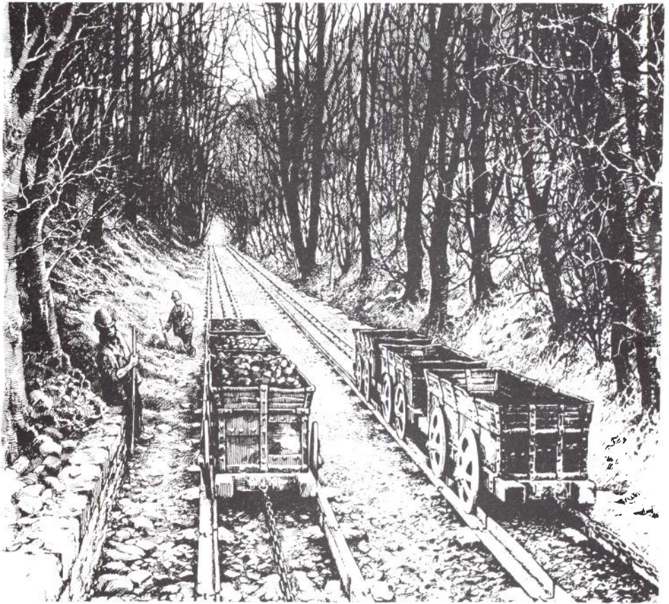
Looking down the Llanfoist incline