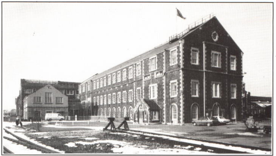
The proposed new headquarters building for RCHME, previously the general offices and drawing offices of the Swindon Railway Works

of site such as malshouses and warehouses and patterns of functional and structural development can be established. Thus, for example, a corpus of information has accumulated on warehouses which spans five centuries and embraces structural features as disparate as arch-braced roof trusses and reinforced concrete frames. This material, united by function, should be capable of analysis and may suggest development threads as yet unexamined by architectural and building historians.