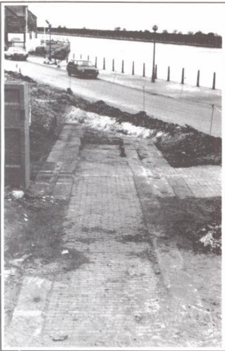
Destroyed slipway: in this photograph the 1840-43 patent slipway at Ellesmere Port has already been cleared to the water's edge for the new access road. The iron posts marked the extent of the slipway before it was lengthened in 1890-93, and may have been part of the original haulage mechanism. This part, too, has since been destroyed for landscaping.