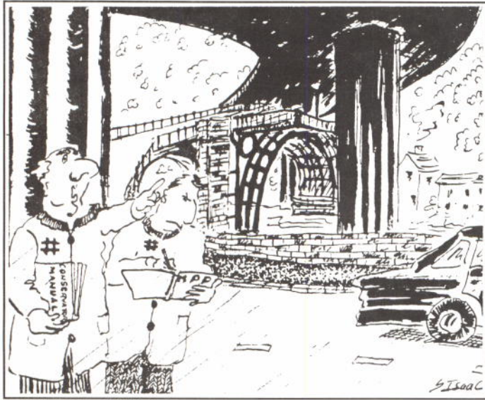
What dreadful windowframes!