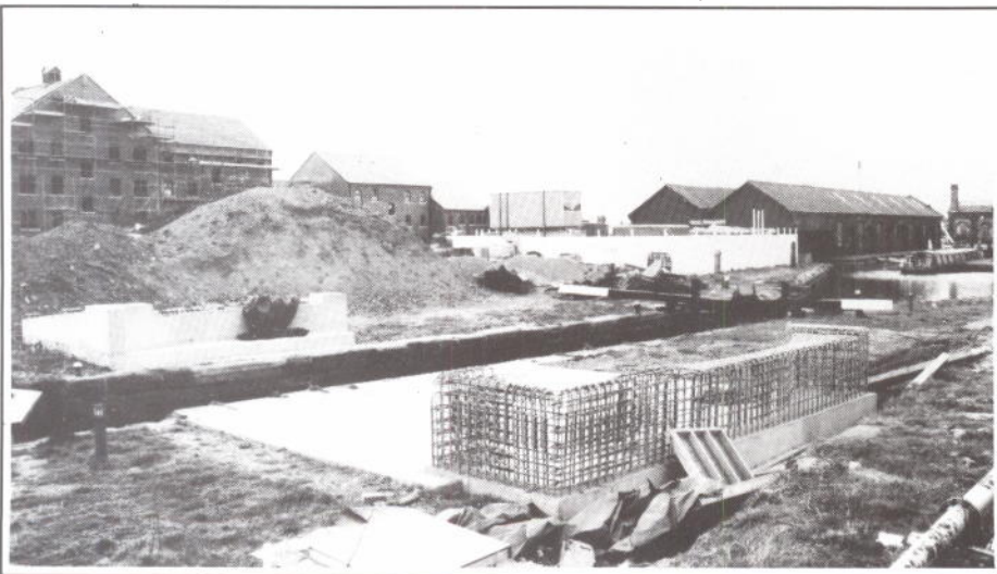
Redevelopment around Ellesmere Port. A new access bridge is being built across the Barge Lock to the Lower Basin for the proposed hotel on the basin's centre island: the bridge's structure and design has been the subject of some debate. The new buildings behind are part of the 'Telford Quays' development.

The National Trust has produced an innovative video for training people responsible for looking after historic houses. It is based on the Trust's Manual of Housekeeping and gives a visual introduction to preventive conservation, handling of artifacts and the daily care of the varied contents of historic houses. The Manual of Housekeeping was published in 1984, based upon a system of housekeeping and day-to-day conservation developed by the Trust. The Manual received world-wide acclaim and has been reprinted no less than six times. The sixty-minute video is accompanied by detailed teaching notes enabling anyone to conduct an informal training session for a group. With the success of this video, perhaps the Trust or others can be persuaded to prepare similar advice on other skills of relevance to industrial archaeology, such as simple building repair, the conservation of excavated sites, and looking after working machinery. The video can be obtained from the National Trust Postal Shopping Service, PO Box 101, Melksham, Wiltshire SN12 8EA for £109.25 plus £1.20 postage in the UK.