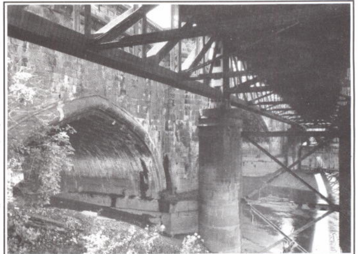
Forgotten monument in an Urban Development area: Brunel's Avon Bridge in J C Bourne's print (below) and today (above). Rediscovered in the RCHME survey of the Bristol UDC, the bridge is to be Listed Grade I.