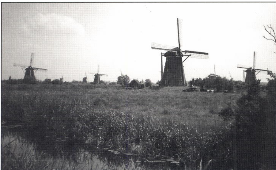
left: The forest of windmills at Kinderdijk: the popular image of the Netherlands