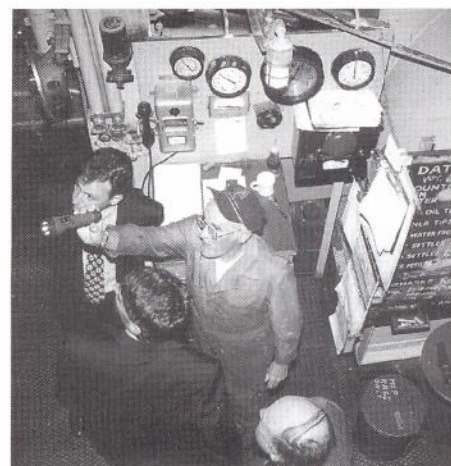
Showing visitors around the lower deck of the engine room, on board the Jeremiah O'Brien , Pool of London, June 1994

It was originally intended that a convoy of three large old steam-powered cargo ships would