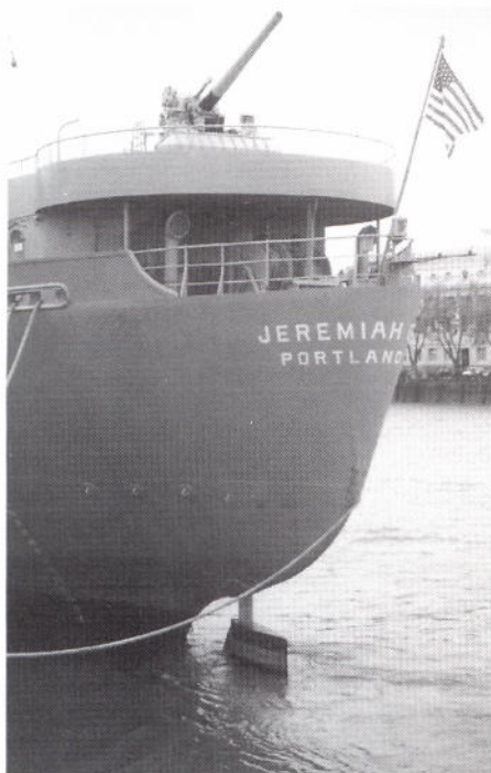
Stern view of the Jeremiah O'Brien moored in the Pool of London, from the South Bank, June 1994