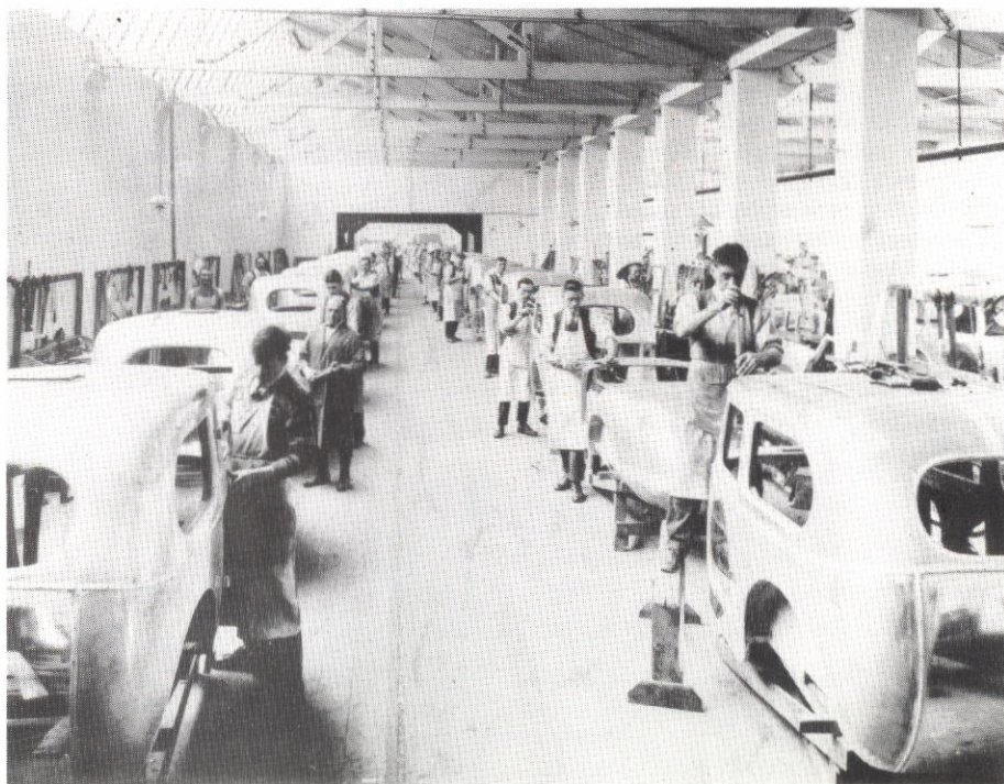
Car production in small brick and timber sheds. The SS, later Jaguar, car factory in a shell-filling factory erected during the First World War, Holbrook Lane, Coventry

● 'There is no point in an industrial archaeologist studying twentieth-century factories, since their form is not related to their function'. Industrial archaeologists have long taken an illogical stance in relation to the issue of 'form follows function' and its importance as a factor in justifying recording and preservation. Blast furnaces and pottery kilns have been preserved in large numbers, while the surrounding casting houses or clay preparation buildings, which are essential to the function of a works, have been lost. The fact that kilns were repeatedly rebuilt and so are rarely original to the foundation of the works is ignored. Mean-