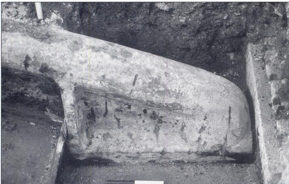
Distinctive bull-nosed end of main bridge girder