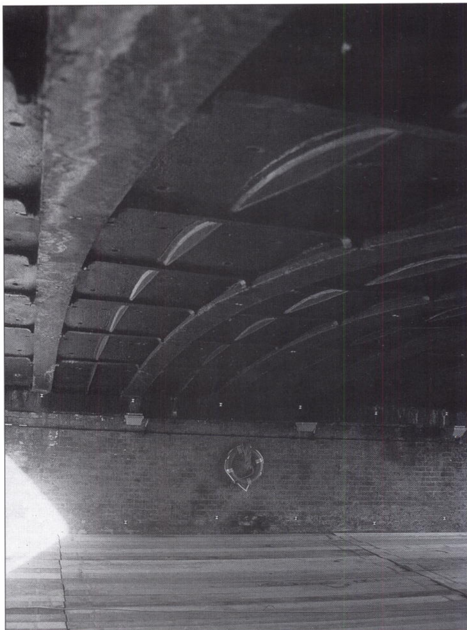
Underside of the main span of the bridge

To keep the girders to practical lengths he used two spans, one of 35 feet (10.67 m) clear width as the main navigational span, for two