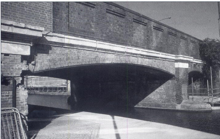
General view of the main span of Brunel's Paddington bridge, with later brick parapet