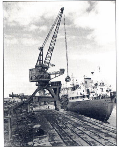
Built in Bath: Stothert & Pitt quayside crane supplied to Royal Portbury Dock

Bath Industrial Heritage Centre, Camden Works, Julian Road, Bath BA1 2RH. ☎ and Fax: 01225 318348.